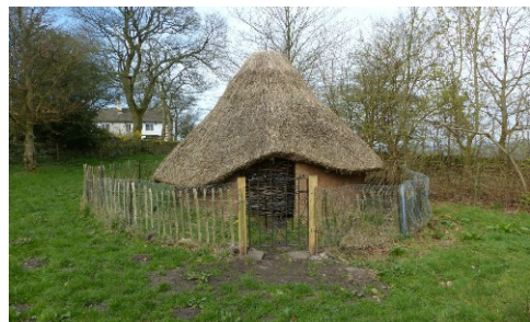
The replica roundhouse at Mellor Hillfort