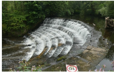
The weir in Etherow Country Park created a head of water for a huge waterwheel at Compstall.