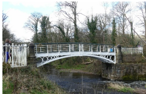
The Iron Bridge in Brabyns Park, built 1813, is a rare early example of a cast-iron bridge.