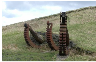
Remnant Kings by Ian Randall is an artwork commissioned for the Irwell Sculpture Trail. The trail runs for 33 miles from Bacup to Salford Quays and was claimed to be the the largest public art scheme in England.