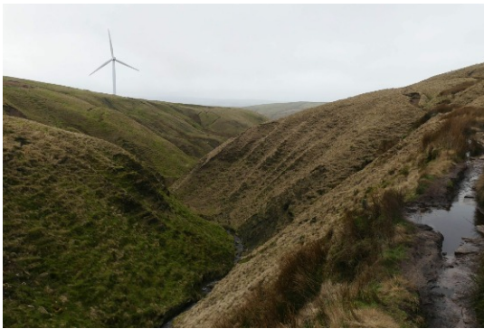
Scout Moor wind farm opened in 2008 and was the largest onshore wind farm in England at the time. There are 26 turbines in all.