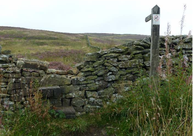
The footpath to Pinhaw Beacon .

field then, when it bends left, go over a stile into felled coniferous woodland. 26 The path ahead winds down between bracken and tree stumps above Elslack Reservoir until it meets a forestry track. 27 Turn left and follow the track, ignoring a path off to the right that leads below the reservoir. 28 At the end of the path leading ahead is a gate that leads into fields. Follow the bottom edge of the field past a farmhouse to a gate out into the road. 29 Turn right and walk down the lane for three-quarters of a mile to Elslack village. 30 At the triangular junction, turn left and walk past Elslack Hall and barn. 31 Retrace your earlier steps along the road for a further half-mile back to the Tempest Arms.