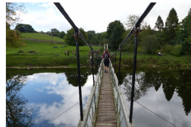
The suspension bridge over the Wharfe was built by the local blacksmith following a drowning at the stepping stones in 1884.