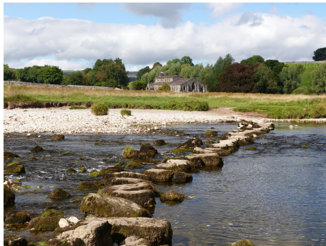
These stepping stones cross the River Wharfe near the parish church of Saint Michael and All Saints, which dates back to the 12th century.