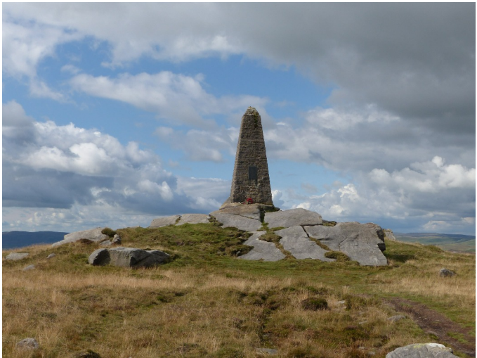
The obelisk on Watts Crag, the highest point of Cracoe Fell, was built to commemorate the 13 men from Rylstone and Cracoe who died in the First World War. It was unveiled in 1922, and three more names were added after the Second World War.