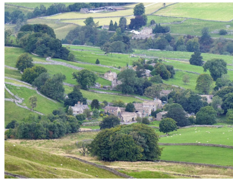
The pretty village of Thorpe from the fell to the south.