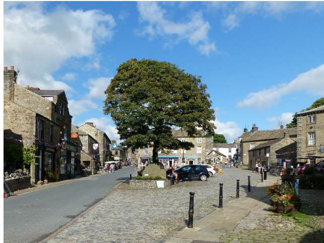
The picturesque village of Grassington stands in for James Herriot's Darrowby in the All Creatures Great and Small series on Channel 5.