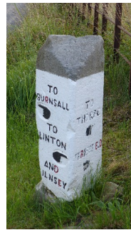
This traditional guidepost near Thorpe is Grade II listed and dates from the mid-19th century.