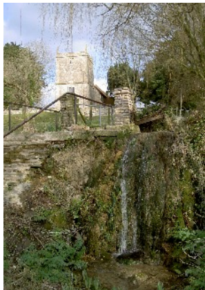
St Martin's Church, North Stoke , has an idyllic position next to a trickling stream and waterfall. Its tower dates probably from the 12th century and Roman bricks have been reused in the fabric of the walls.