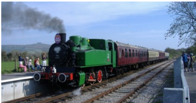
The Avon Valley Railway runs from Oldland Common to the Avon via Bitton, a distance of three miles. Both steam and diesel locomotives are run at weekends.

Now follow steps 17–20 of the Sir Bevill Grenville's Monument walk (left) to guide you back to the Charlcombe Inn.