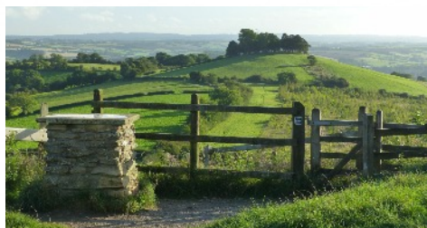
Kelston Round Hill from Prospect Stile