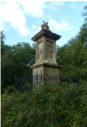
Sometimes described as the UK's first war memorial, Sir Bevill Grenville's Monument , erected in 1720, commemorates the death of the Royalist commander at the Battle of Lansdowne in 1643.