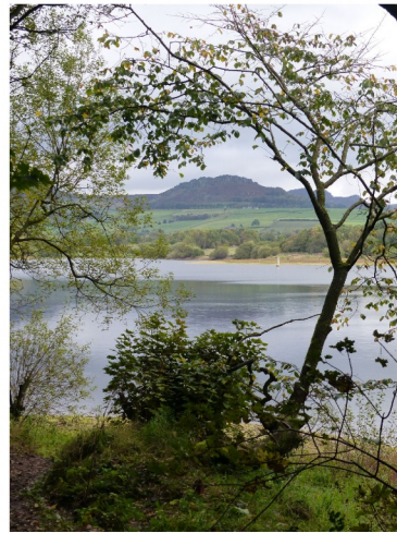
Tittesworth Reservoir was first built in 1858 and is fed by the River Churnet. The reservoir was extended in 1959-62 and now covers an area of 190 acres. A visitor centre was constructed at the northern end in 1998 and a recently completed trail runs round the entire perimeter. The reservoir lies below the dramatic rocky outcrops of Hen Cloud and the Roaches.