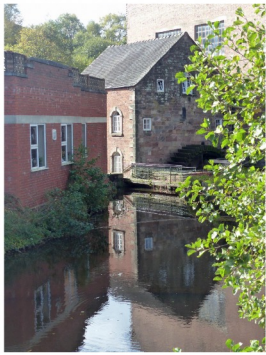
Brindley's Mill was built in the 1750s by the canal pioneer James Brindley. It is open as a museum on Sundays and Bank Holidays from Easter to September.