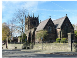
St Edward's church is Leek's only surviving medieval church and was built in the 14th century after a fire in 1297 destroyed the previous Norman church. It retains its original rose windows, and a fine oak roof. Needlework by the Leek Embroidery Society and stained glass designed by Edward Burne-Jones for the William Morris company are among the church's newer treasures. There are two Anglo-Saxon cross shafts in the churchyard.