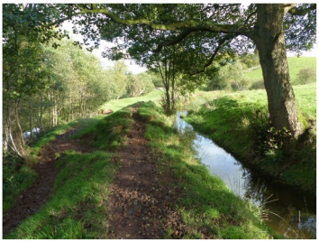
A canal feeder runs from Rudyard Lake for 3 miles to supply water to the Leek arm of the Caldron Canal.