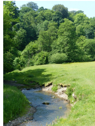
Erddig Country Park